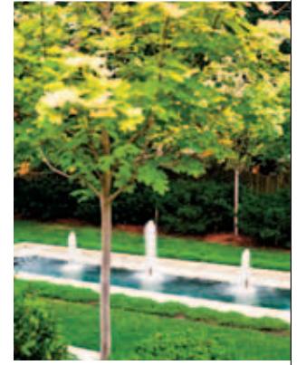
Opposite: Retaining walls divide the yard into sections and remedy the difficulty of sloping grounds. Above: The '30s-era home has Spanish influences. A shallow pool provides calming scenery and cools hot feet in the summer.

The mission of Detroit Home : Each issue showcases metro Detroit style — how we design, build, furnish, landscape, and live in our homes.